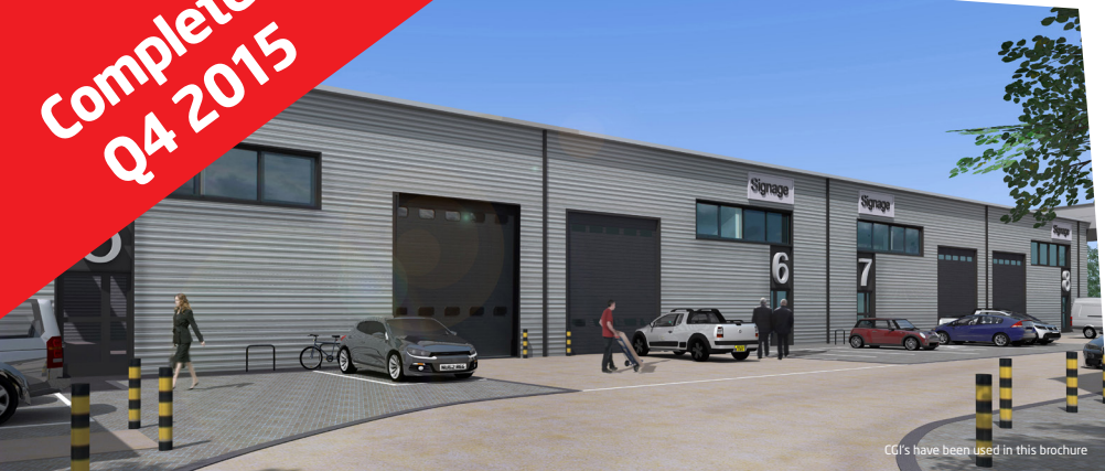
CGI's have been used in this brochure